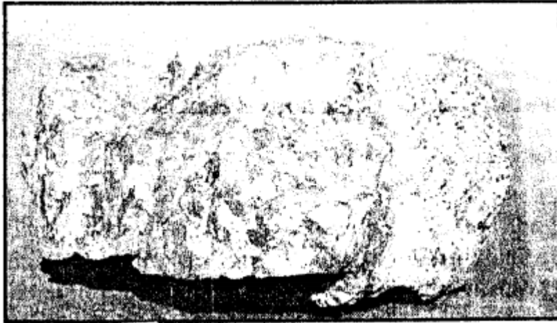
Permadite (an igneous rock)

surface and beneath the crust respectively.